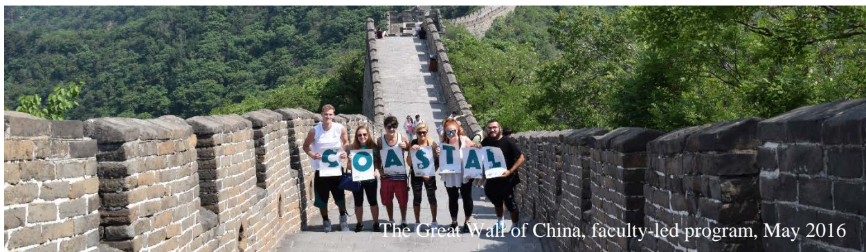
The Great Wall of China, faculty-led program, May 2016